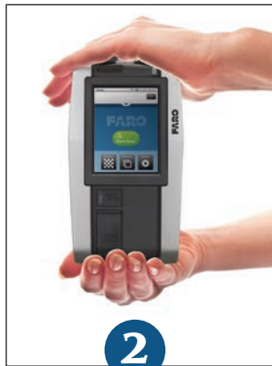
User-friendly touch screen operation